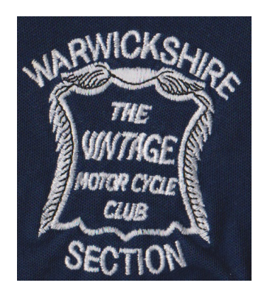
December 2020 Newsletter No. 17