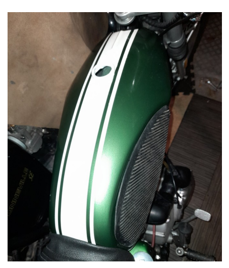
Looking better – 3rd time

Having sprayed it twice myself and with the weather turning colder and wetter I decided to give the job to my friends son who repairs bodywork and is an experienced sprayer. The result looks excellent. I